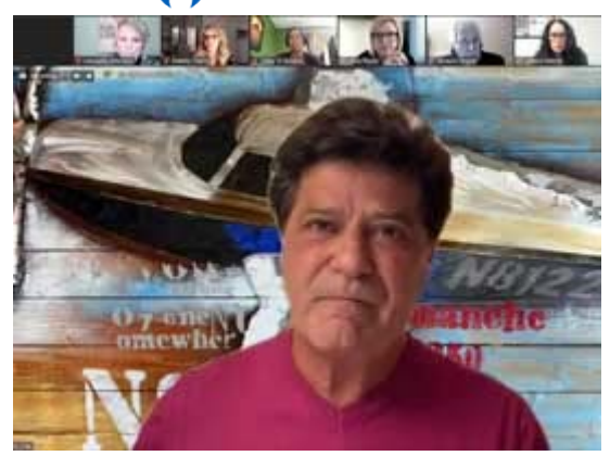
Watch highlights of Unifor's online vigil on December 6, the National Day of Remembrance and Action on Elimination of Violence Against Women, where