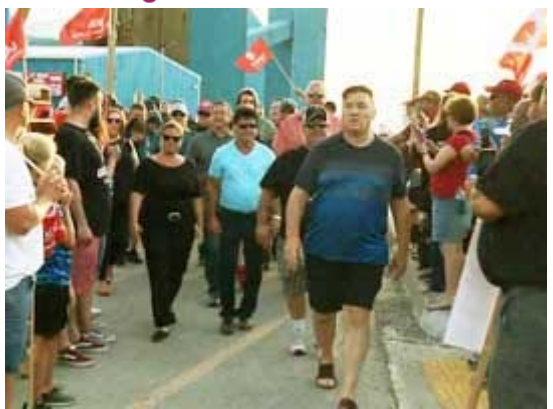
With a Quebec court expanding the definition of a scab in that province,