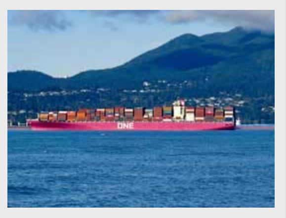
What's going on with inflation in Canada? Check in on which prices are actually rising, which aren't, and a few reasons why.