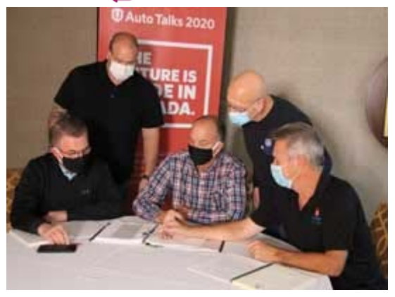
As part of our 2021 Recovery Based Bargaining Program, new sample language is now available on several key priorities, to help your local committee at the bargaining table.