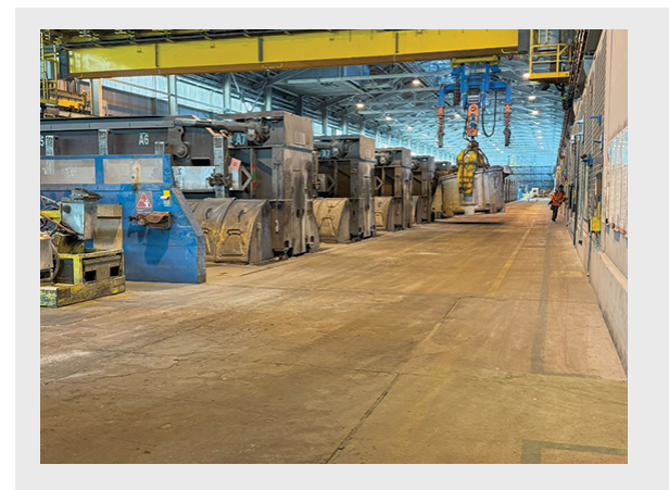
U.S. steel and aluminum tariffs will damage industry and workers in both countries.