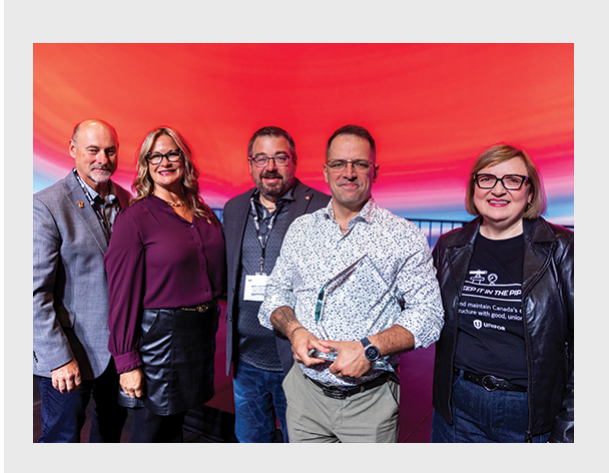
Nominations are now open for the 2025 Unifor Bud Jimmerfield Award, recognizing outstanding health and safety activists