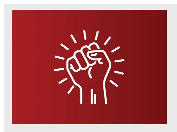
On March 21, Unifor marks the International Day for the Elimination of Racial Discrimination.