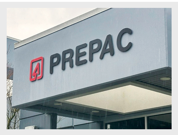
Furniture manufacturer Prepac is caving to pressure to shift operations to the U.S., killing 170 Canadian jobs.