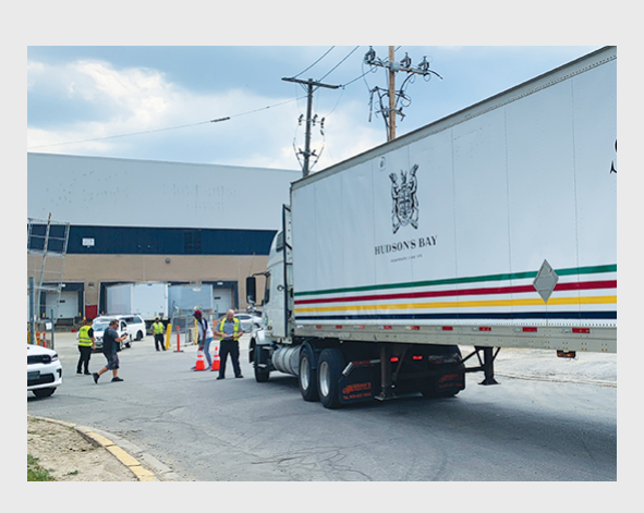
Unifor calls on Hudson's Bay to prioritize worker's wages, pension and benefits following the company's credit protection filing.