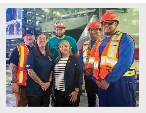
The largest "Buy Canadian" procurement order ever signed was recently finalized at the Halifax Shipyard.