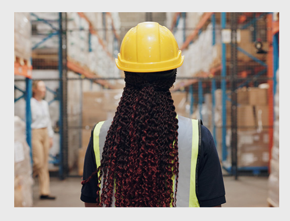
Unifor's new education module on tariffs breaks down how trade policies impact workers, industries, and the fight for fair trade.