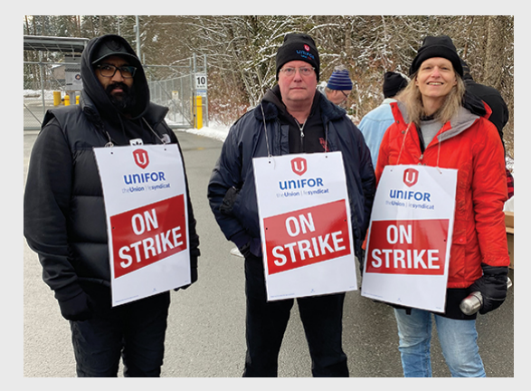
Transit workers at Transdev in the Cowichan Valley, B.C., went on strike on Feb. 8, after talks broke down between Unifor and the employer.

Join Unifor members at events on February 14 to honour missing and murdered women, girls, and two-spirit people.