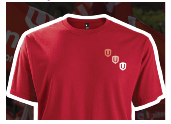
Wear Unifor red on Saturday to stand up for Canadian jobs and the industries that keep our communities strong.