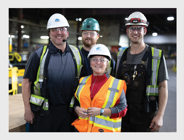
Members at Local 434 at Maibec CanExel in Nova Scotia negotiated that

Unifor donates $15,000 to support Canadian Journalists for Free Expression to aid persecuted journalists, protect the