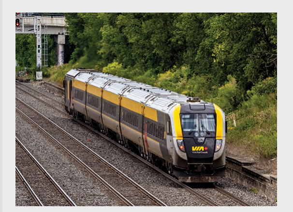
Unifor urges CN to prioritize effective rail management and collaborate with