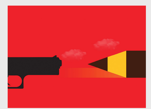
Unifor commemorates the International Day to End Impunity for Crimes Against Journalists on Nov. 2.