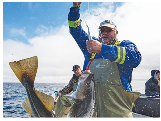
FFAW-Unifor fish harvesters are calling for an immediate return to a Stewardship