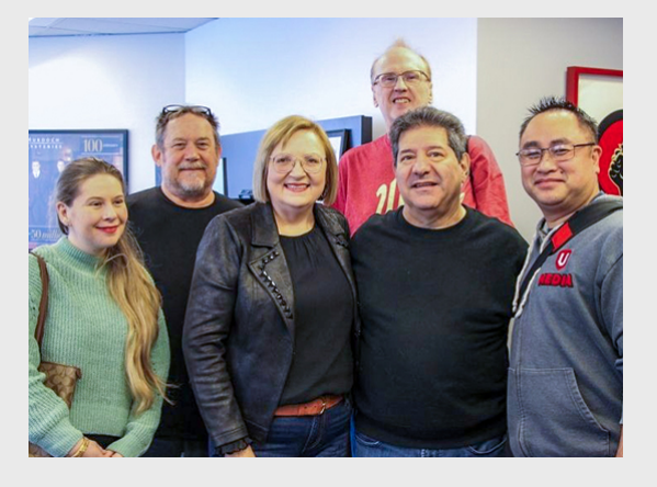
Unifor locals embraced the opportunity to meet with the union's leadership and staff at an Open House at the national office on Jan. 24.