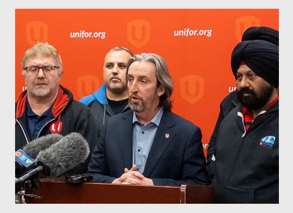
Coast Mountain Bus Company's refusal to find a solution in the transit supervisors dispute resulted in two days of lost wages for Unifor members.