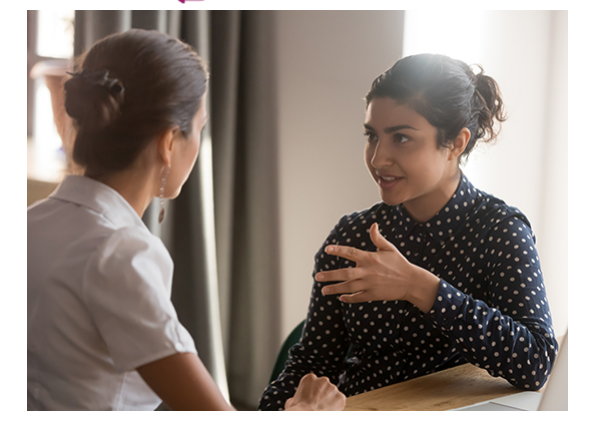
Interested in knowing more about Unifor's internationally recognized Women's Advocate Program? Read the pamphlet