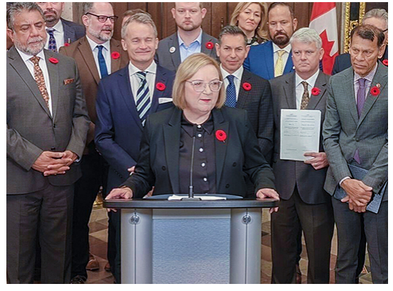
Watch Unifor National President Lana Payne comment on anti-scab legislation tabled November 9.