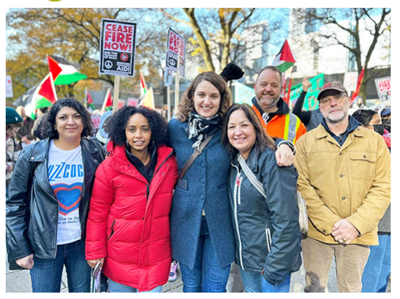
Unifor members rallied in support of peace and joined the call for a