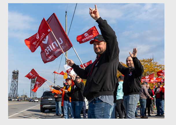
Unifor has reached a tentative agreement with St. Lawrence Seaway Management Corporation.