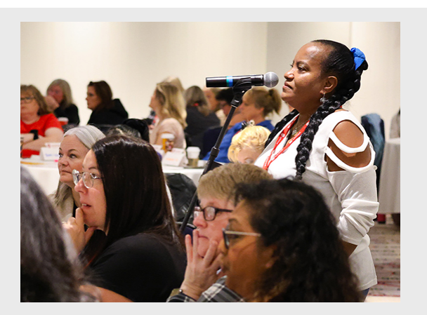
The 2023 B.C. Women's Regional Conference highlighted leadership at every level of Unifor.