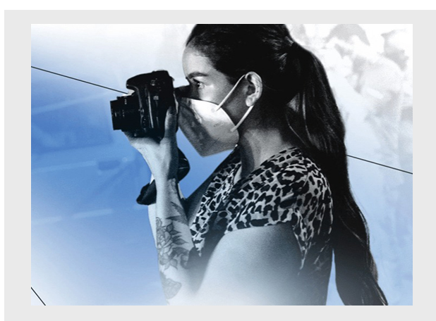
November 2 is the International Day to End Impunity for Crimes against Journalists.