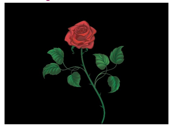
Order your materials today for the December 6 International Day for the Elimination of Violence Against Women.