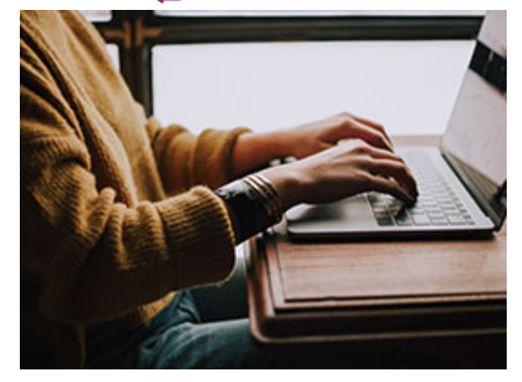
Take the new 30-minute online module: So you're a union rep...now what?