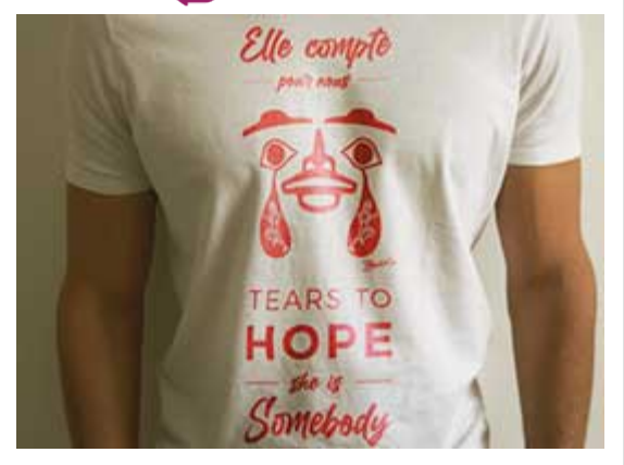
Register your local union's team to be part of the relay race raising money for the Tears to Hope Society.