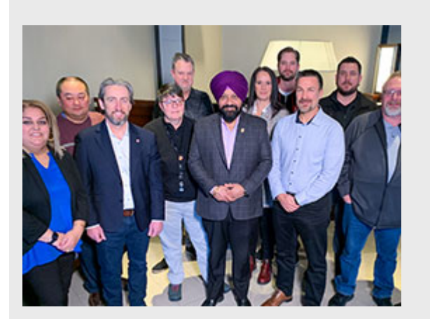
Unifor members in Metro Vancouver ratified an industry-leading agreement for transit operators, trades, and maintenance staff.