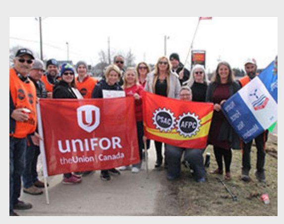
During this crucial period, Unifor stands alongside the Public Service Alliance of Canada (PSAC)'s 155,000 sisters and brothers in their conflict with the Treasury Board and the Canada Revenue Agency. Read our statement.