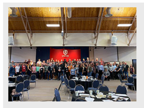
Unifor's Telecommunications Conference taught delegates about rights at work and built solidarity and activism.