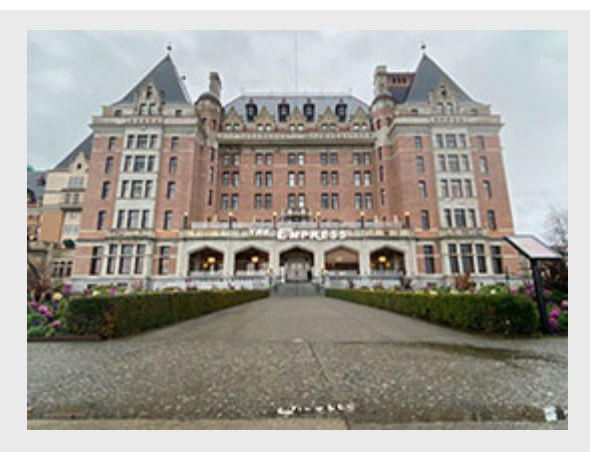
Fairmont Empress Hotel members win historic gains as new collective agreement increases wages 14.5% over three years plus Cost-of-Living Adjustment while securing a more manageable workload.