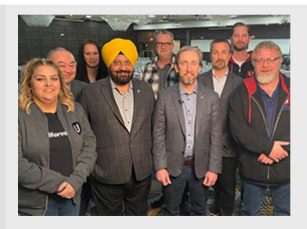
Coast Mountain Bus Company members from Unifor locals 111 and 2200 achieve wage increases and benefits enhancements in new collective agreement.