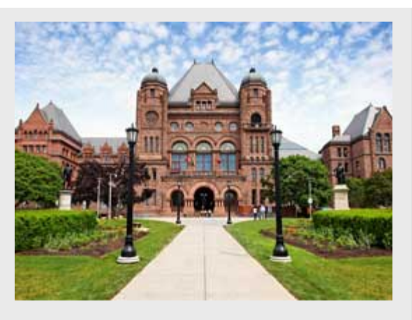
The Ontario government's 2023 budget must reinvest in public health care and support workers and critical industries to make better use of recent windfalls.