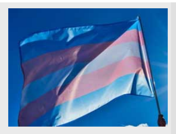
Unifor calls for action both within the union and beyond on the Trans Day of Visibility.