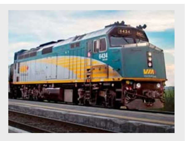
Unifor calls on the federal transportation minister to provide clarity about the long-term plan for VIA Rail, following the government's Request for Qualifications for the proposed High Frequency Rail line.