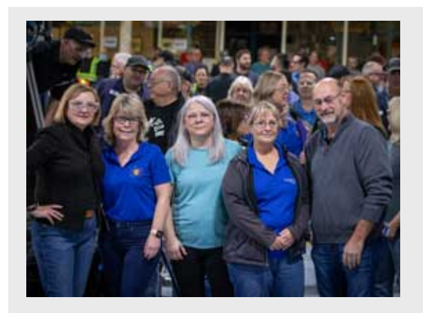
GM St. Catharines members have secured a bright future, building electric vehicle propulsion systems for years to come. See photos from this historic announcement.