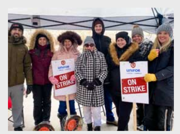
Concessionary demands for contracting out work are among the issues that forced Unifor Locals 1959 and 240 to begin legal strike action at Windsor Salt in Windsor, Ont.