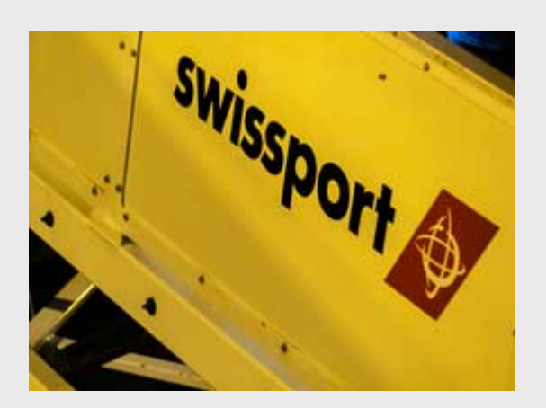
Unifor is concerned that a contract flip that resulted in Swissport losing its contract with Pierre Elliott Trudeau International Airport may leave up to 150 Unifor members without jobs at the end of June.