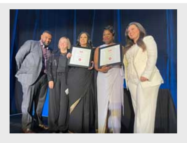
Three women journalists, two of whom are Unifor members, were recognized Wednesday night at the Canadian Journalists for Free Expression gala in Toronto for their brave efforts to fight back against misogyny and their online abusers.