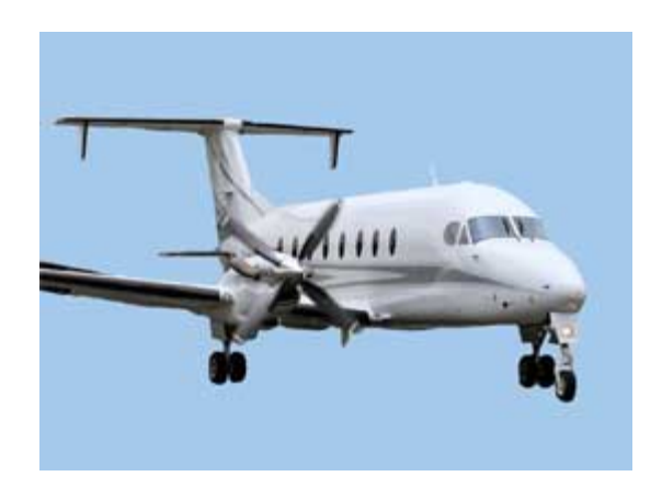
The Newfoundland and Labrador Court of Appeal has ruled that Unifor's challenge of an arbitrator's decision affecting Exploits Valley Air Services pilots can go forward.