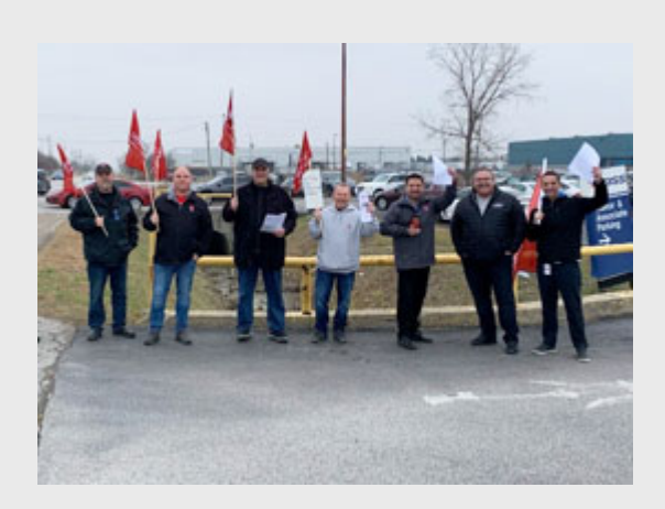
Momentum to unionize continues to grow across Canada's auto parts sector, after 600 workers at TRQSS Inc., a seatbelt manufacturer in Windsor, Ont., voted to join Unifor.