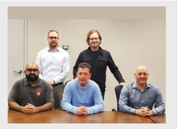
Unifor Local 101R has reached a tentative agreement with Canadian Pacific Railway (CP), covering 1,200 workers at 18 locations from British Columbia to Quebec.