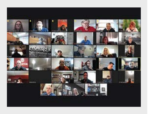
Unifor's IPS Council gathered to address the challenges and opportunities of building a strong and resilient auto parts industry.