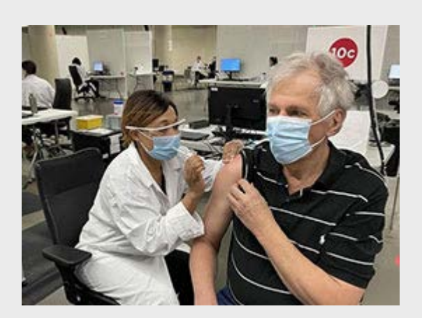
March 11 marks the beginning of the third year since the World Health Organization formally declared COVID-19 a pandemic, read Unifor's statement.