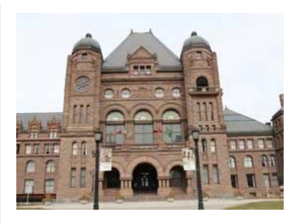
Ontario Regional Council begins next week, with health care, child care and the upcoming provincial election on the agenda.