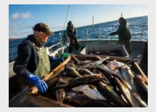
Fish harvesters on the East and West Coasts speak out against new federal Fisheries and Oceans Minister who suggested fish harvesters find new careers.

Unifor condemns Premier Ford's repeated misuse of injured worker's WSIB funds to cut cheques for business owners.