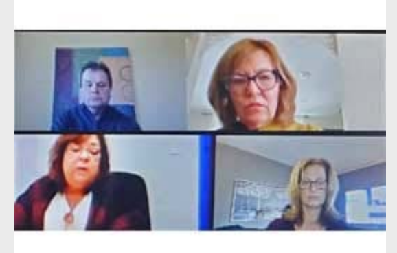
Unifor representatives and frontline Registered Practical Nurses met with Ontario Minister of Health Christine Elliott to discuss systemic issues and offer concrete solutions to retain and recruit health care workers in Ontario.