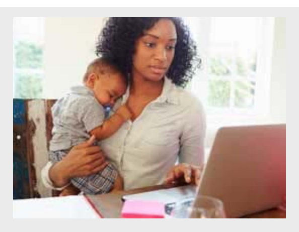
Nova Scotia's speeds ahead with child care fee reduction while Ontario families are left waiting.