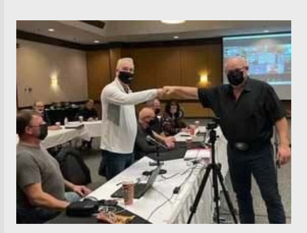
Unifor and PPWC reach pattern agreement with Canfor for 900 forestry workers in Western Canada.