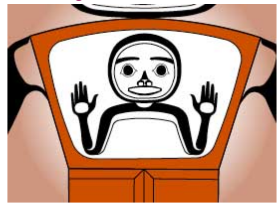
On Friday, Sept. 30, join Orange Shirt Day events in your community to take action on reconciliation. Download and share the union's poster and resources