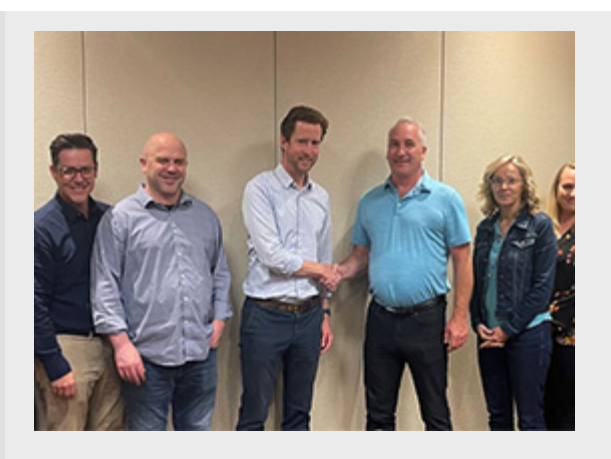
Nearly 800 newly organized WestJet workers in Calgary and Vancouver have reached a tentative first collective agreement, avoiding any service interruption in advance of Tuesday's strike deadline.