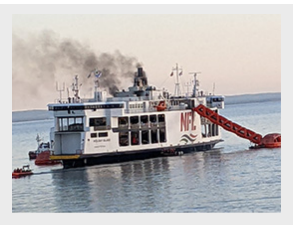
Unifor members saved lives with their quick action and brave management of a fire in the engine room of the Nova Scotia to PEI ferry. All 183 passengers, their pets, and the 22 crew were evacuated safely.