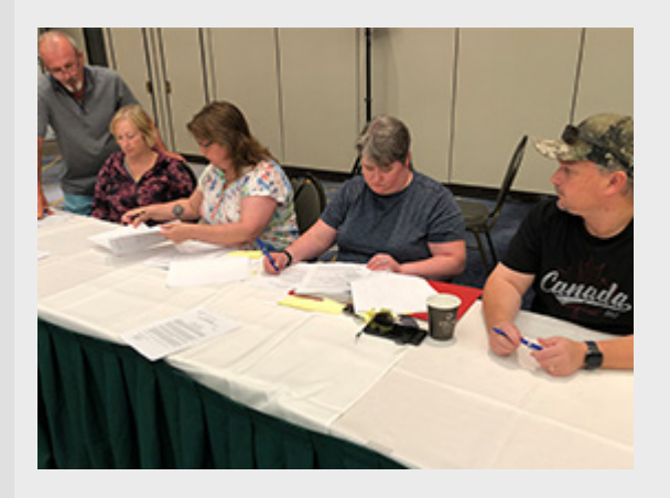
The bargaining committees for Unifor members at six Great Canadian Gaming Corporation (GCGC) casinos in Ontario have signed a tentative agreement.