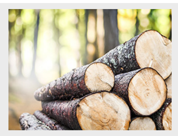
Paper Excellence acquires Resolute and Unifor is relieved the company is committing to maintain staffing but awaits a review by the Competition Bureau.