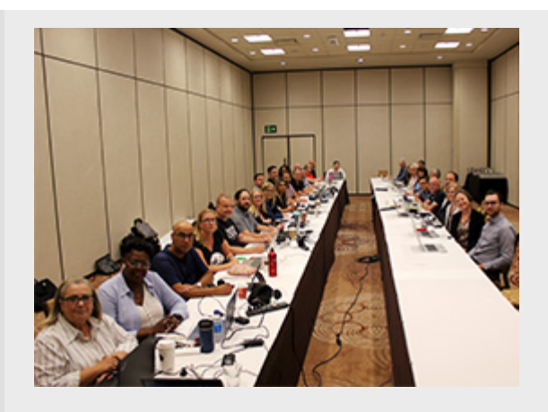
Talks ended between Bell and Unifor's 6,000 members in the Bell Clerical and Aliant groups following a week of simultaneous negotiations, pushing Unifor ACL to declare an impasse.