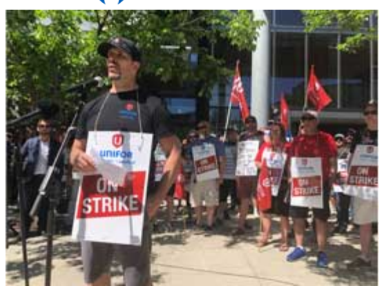
Unifor Local 681 members at Manitoba Hydro began rotating strikes on June 17. Watch the rally and hear about