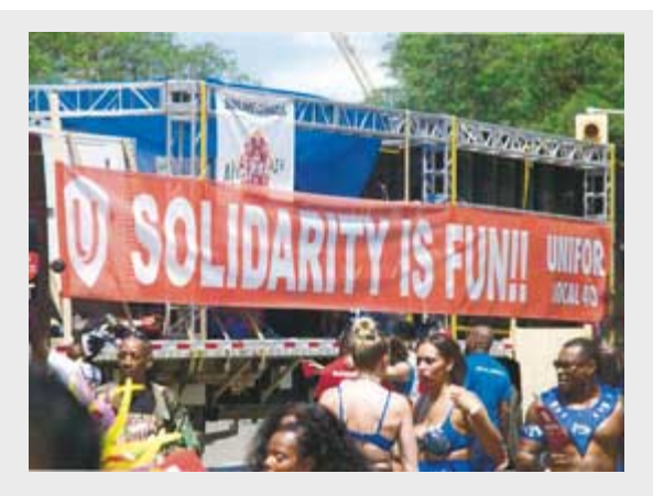
After two years of missing the parade because of COVID-19, communities are gathering at the 2022 Toronto Caribbean Carnival July 30 with Unifor's presence – in the union's signature red and white colours.