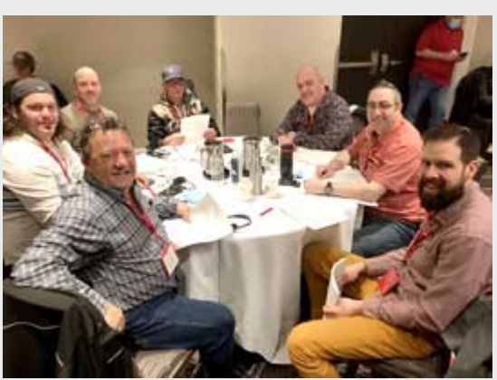
Close to 200 delegates gathered in Montreal for the Eastern Forestry Wage Caucus where members and leaders in the sector set bargaining priorities and selected Resolute Forest Products as the target employer.