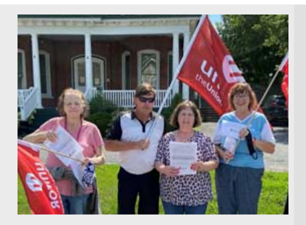
Shelter workers at the Lennox and Addington Interval House in Napanee ratified the employer's most recent offer, ending a five-month strike.