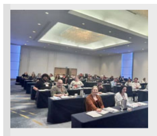
Long-term care workers meet in person for the first in two and half years and plan mobilization to impact Ontario election.