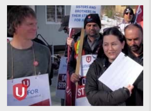
Since January 29, a petition to support Local 114 members on strike has been signed by 2,000+ supporters in the region.