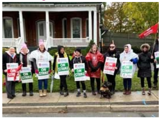
Demand a fair contract for striking shelter workers in Napanee. Add your name today.